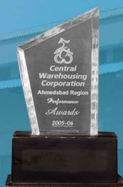
1st Place CHA-Exports Central Warehousing Corporation Performance Award 2005-06 For Kandla. (Ahemdabad Region)