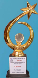
1st Position CHA-Exports Concor Awards 2015-16 at Gandhidham, India.