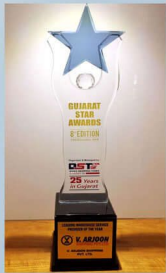
Leading warehouse service provider of the year (Winner) Gujarat star awards 2019 8Th Edition.