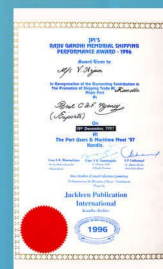
Jackleen Publication International's Rajiv Gandhi Memorial Shipping Performance Award-1996 For Best C&F Agency (Exports) At Kandla (India)