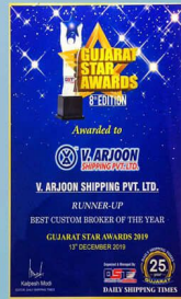
Best Custom Broker Of The Year (Runner-Up) Gujarat star awards 2019 8Th Edition.