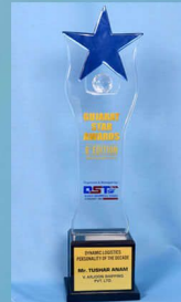
Dynamic Logistics personality of the decade Gujarat star awards 6th edition 2017.